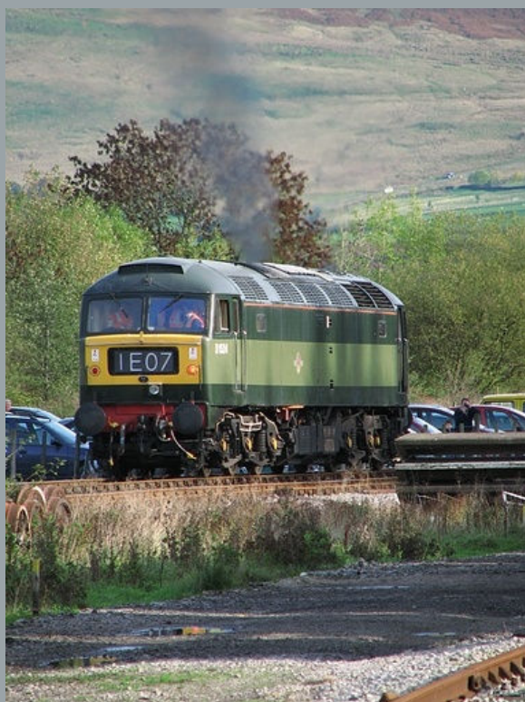
Making its debut in preservation during October, 47004 in action at Bolton Abbey 29/10/06.