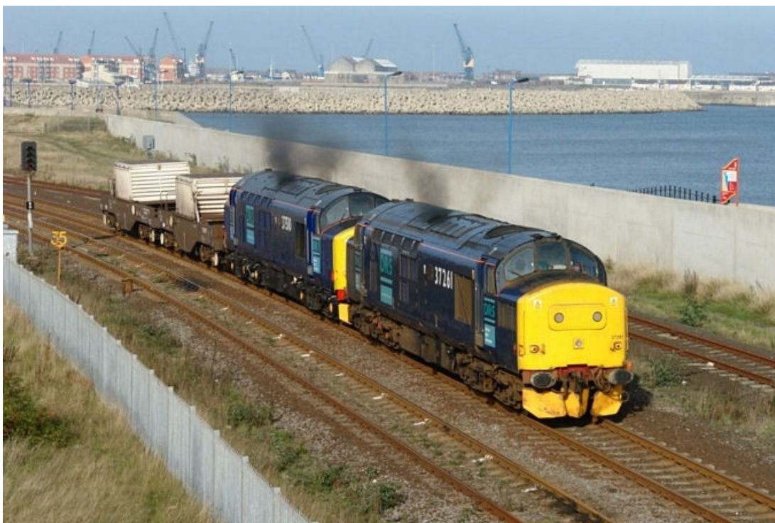
37261 and returnee 37510 at Hartlepool 18/10/06

43122 43126 and 43194 (all IWRP) have been hauled from Landore to Loughborough for re-engineering at Brush exchanging places with 43133 (IWRP) which is released following MTU conversion. 47714 was provided for traction. The arrival of 43122 and 43194 at Brush completes phase one, so to speak, as these are the final two power cars owned outright by First Group to enter the re-engineering program at Loughborough. 60074 (WNTR) has completed its move from Thornaby to Toton via a stop over at Aldwarke.