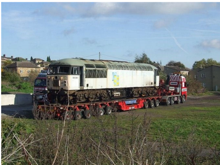
On its way... 56061 loaded ready to leave Barrow Hill for Stockton 30/10/06