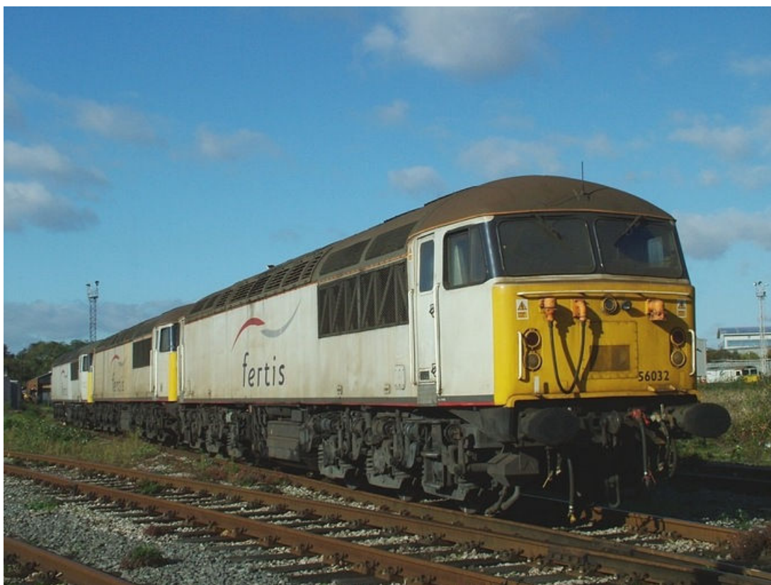
56032 with 56074 and 56096 at Old Oak Common 31/10/06.

92028 (WNWX) was returned to Crewe EMD from Wembley Yard on the 24th.