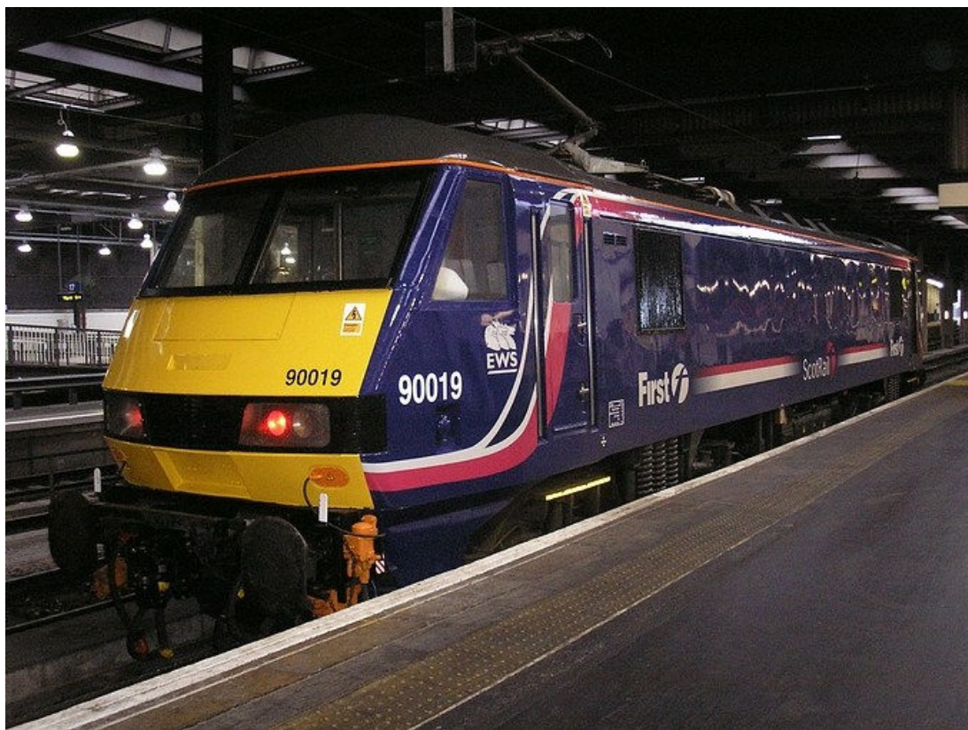
First ScotRail liveried 90019 at Euston 11/10/06