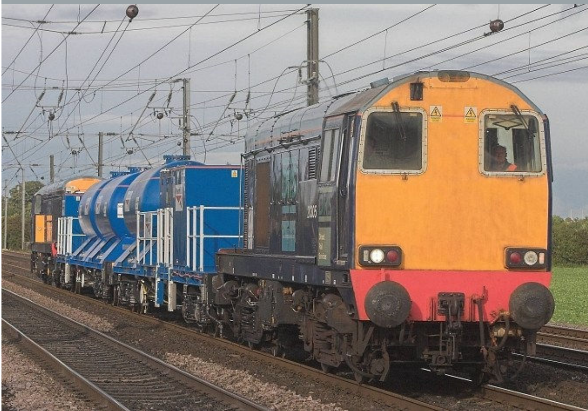
Autumn it is and the Sandite season is underway... 20305 and 20303 top and tail a Rail Head Treatment Train (RHTT) formation near York 01/10/06.