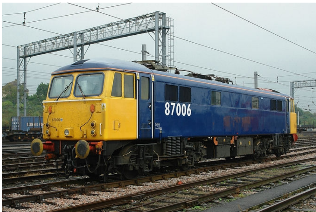
WCML duties over? 87006 at Wembley 11/10/06

Due to the non availability of a steam locomotive for the Whitby - Grosmont - Glaisdale shuttle on the 15th (Sunday) WCRC are providing a diesel replacement which should be 37248. The shuttle leaves Whitby every two hours at 10:15, 12:15, 14:15, 16:15 and 18:15 whilst departures from Grosmont are timed at 09:25, 11:25, 13:25, 15:25 and 17:25.