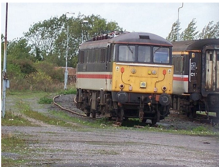
Following transfer from Glasgow 86228 at Coalville 06/10/06

87007 from store at Wembley has been reinstated to the IWCA pool exchanging places with 87026 which is now stored SBXL at Wembley.