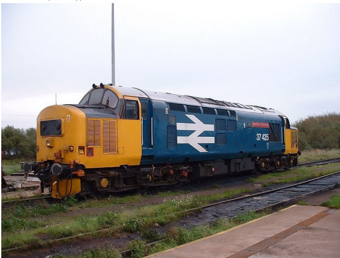
37425 at Margam 22/10/06 awaiting its fate.

31459 (SDPP) undergoing attention at Barrow Hill has been repainted into the FM Rail 'more black' scheme as sported by 47832. 20066 (HNRL) is part way through being painted in Corus green whilst 37667 (HNRS) is in blue undercoat ready for its application of DRS Blue.