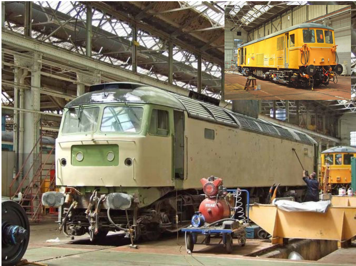
47739 and (insert) 73141 undergoing overhaul at Eastleigh Works 04/06/08

Collected and removed from Eastleigh Yard by road 47791 (MBDL) is on its way north overnight to Barrow Hill. 47791 is set to feature as a runner at the forthcoming Barrow Hill gala weekend.