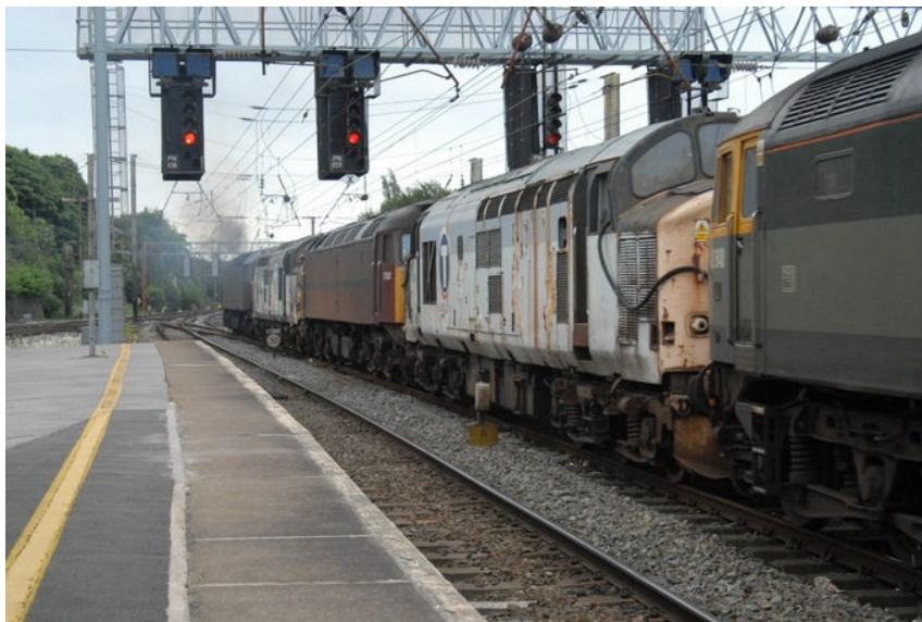
47804 37407 57601 37424 and 47851 pass through Preston 10/06/08