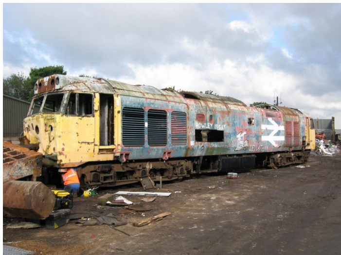
50040 in the yard at Sims Metals, Halesowen 28/06/08

The movement by road of the three stored Class 60s from Immingham has begun with the transfer to Toton of 60098 (WNTS).