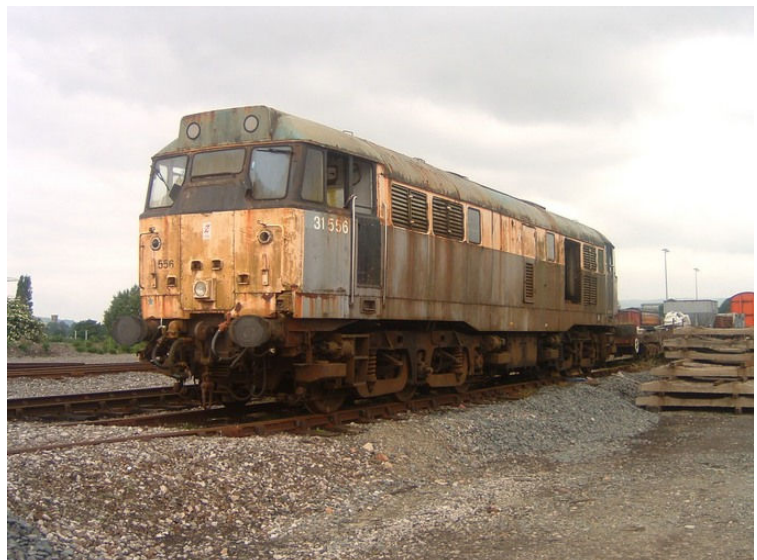
31556 awaiting collection from Bury 08/06/08

37682 (HNRS) recently moved to Barrow Hill from LaFarge and 37683 (HNRS) currently at Long Marston awaiting transfer to Barrow Hill are to be returned to working order / mainline standards for an as yet unspecified mainline operator. Also due to move up to Barrow Hill from Long Marston is 20016 (HNRS) which is also to be returned to running order. 20056 / 81 (HNRL) is to return to Barrow Hill from Scunthorpe leaving 20066 / 82 in use on hire to Corus.