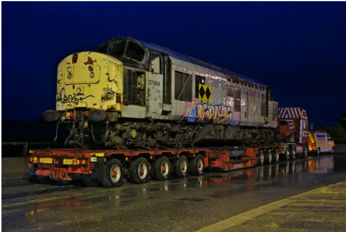
En route Tyne Yard to Kingsbury 37894 at Woodall Services on the M1 near Chesterfield 26/06/08