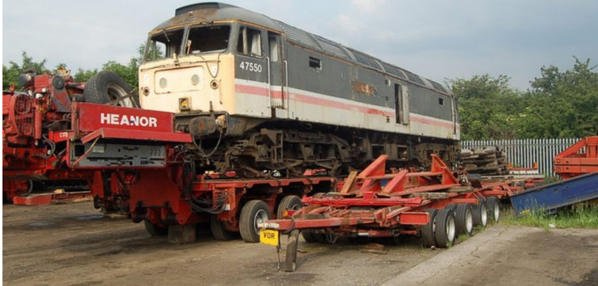
47550 at Heanor, Langley Mill 08/06/08