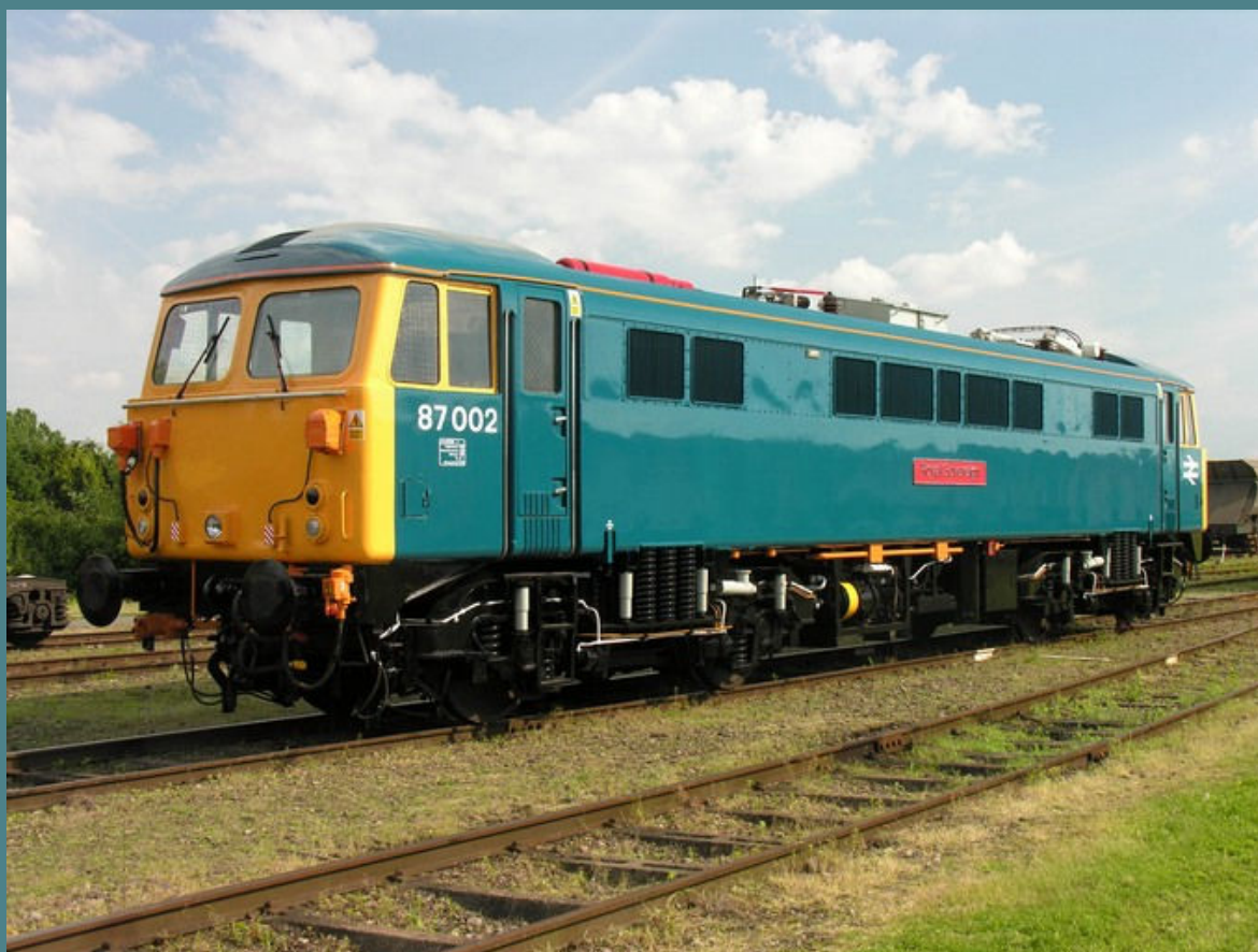
BR Blue 87002 at Long Marston 06/06/08