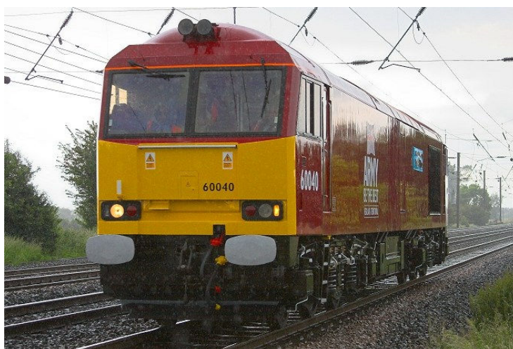
60040 approaching York 13/06/08

Repairs complete at Eastleigh the EWS Class 37 fleet has been bolstered with the return to service of 37422 (WFMU).