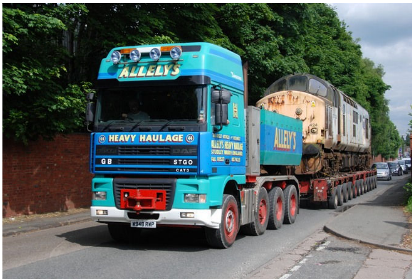
37424 leaving Crewe on a low loader 12/06/08

Collected from Crewe EMD yesterday 37407 (WNSO) has been transported by road to the Churnet Valley Railway.