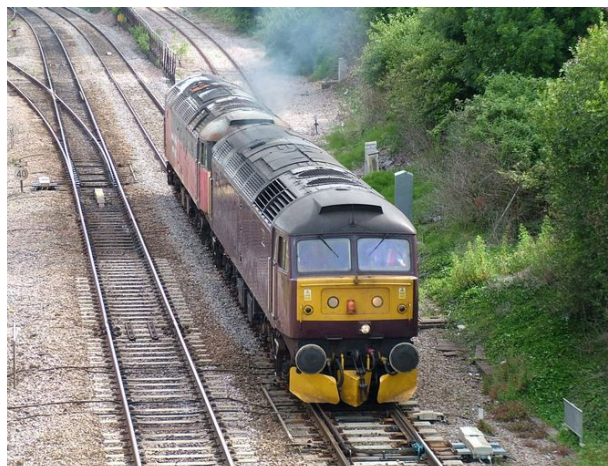
47245 with 47772 at Gaer Junction, Newport 26/06/08

Barry WRD residents 57002 and 57003 have been added to the DRS fleet subsequently transferring from the SBXL storage pool to the XHHP DRS holding pool. This development leaves only Crewe LNWR resident 57001 available for Cotswold Rail / Advenza if they are to add to their current pair of Class 57s.