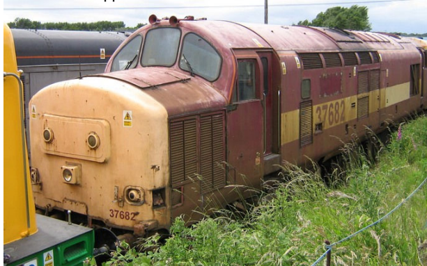
37682 at Barrow Hill 22/06/08