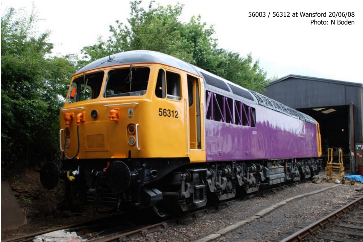
56003 / 56312 at Wansford 20/06/08

At Wansford 56003, undergoing conversion to 56312 and now physically numbered as such, has been painted into a rather unique but effective purple and yellow colour scheme.