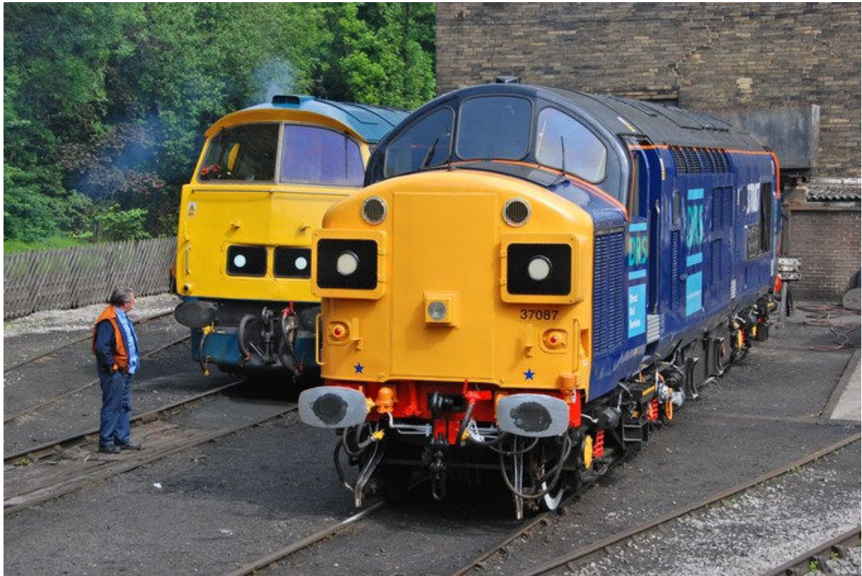
37087 and D1023 on Haworth shed 06/06/08

Released from Brush Traction following a power unit transplant 43068 (GCHP) has been despatched back to Heaton by road.