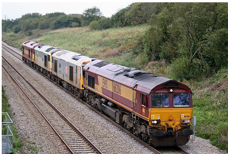
66206 with 60033 60067 and 60037 at Stormy Bank 24/09/08

60033 60037 and 60067 (all WNTS) have been removed from Margam and are to go to Toton. The first leg of their journey today, to Newport, was behind 66206 running as 0253 to ADJ.