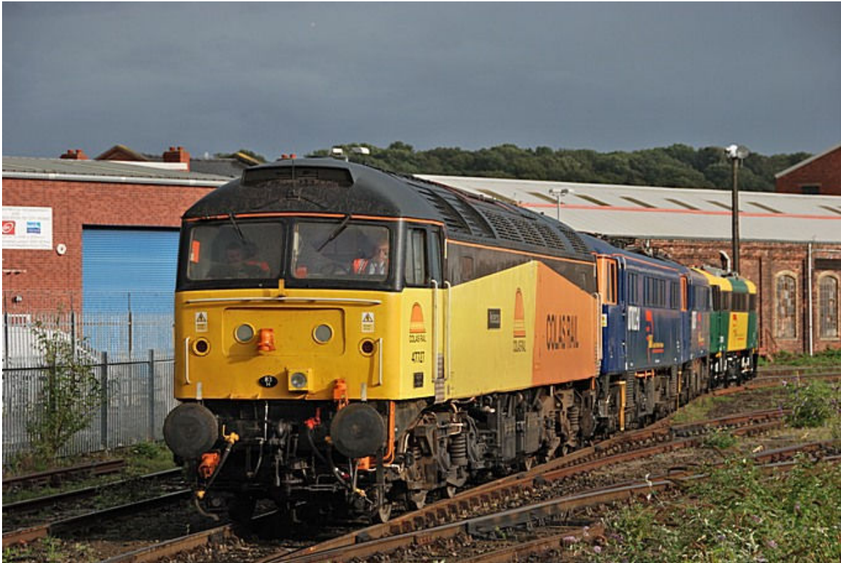
47727 with 87022 87028 and 87010 in tow at Worcester Shrub Hill 02/09/08

Retimed to run a little later than advised Colas 47727 was utilised to collect 87010 87022 and 87028 (all SBXL) from Long Marston for transfer to Crewe LNWR. Following a rather lengthy stop over in the yard at Worcester due to pathing and route issues in the Birmingham area the convoy proceeded towards Crewe overnight.