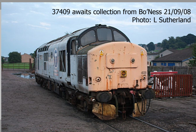
37409 awaits collection from Bo'Ness 21/09/08