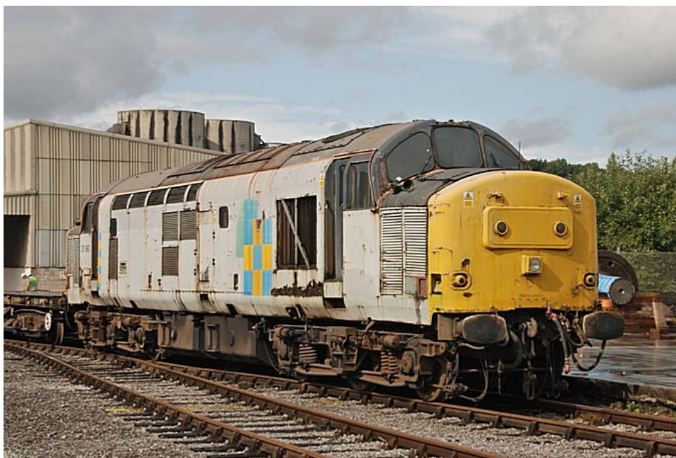
37676 on view at LaFarge 04/09/08

(see below) is now, according to the Royal Scots Grey website, open to the general public. 56312 is to remain at Wansford until re-certified and thoroughly tested then enter traffic directly from there.