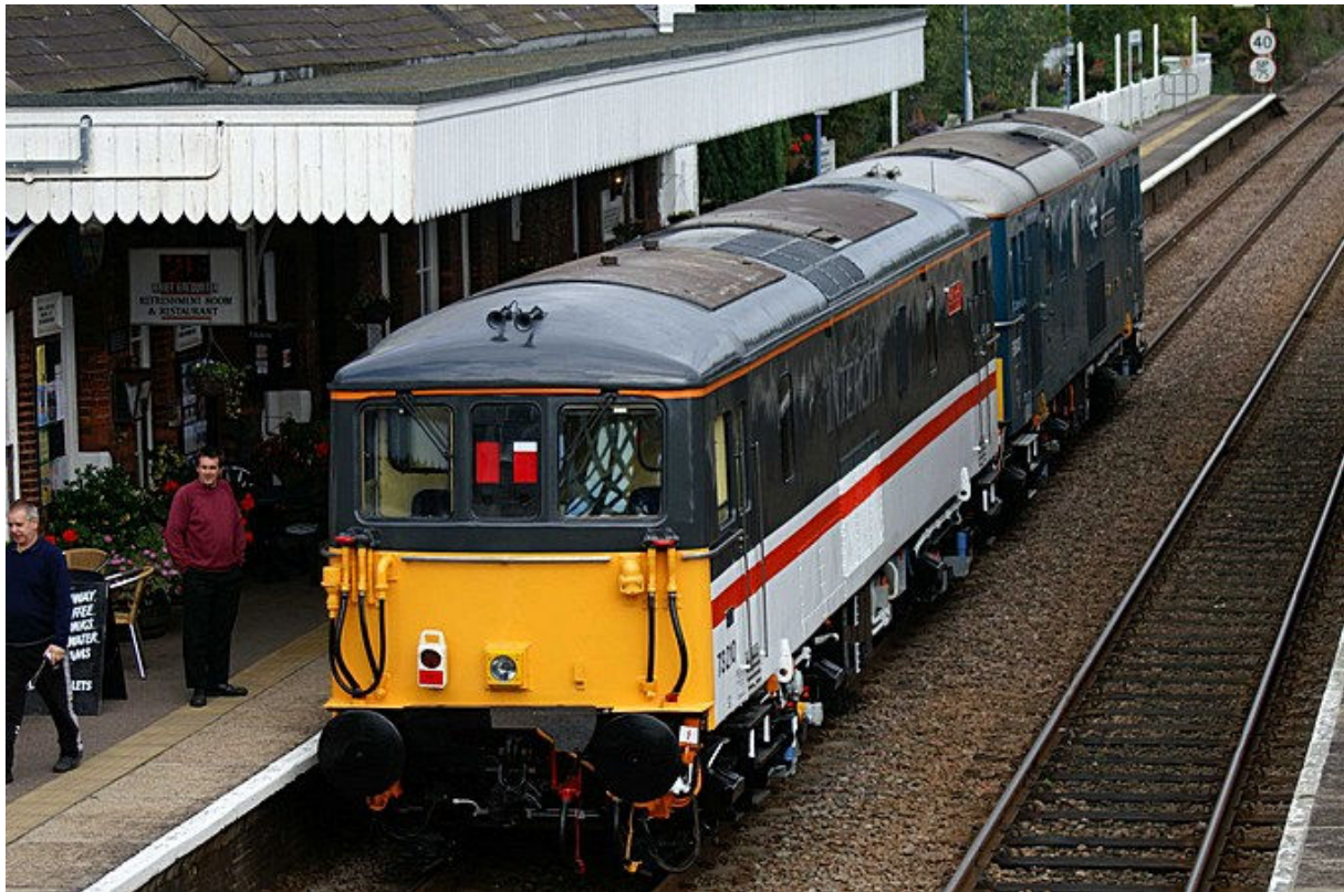
73210 arrives at Wymondham 25/09/08