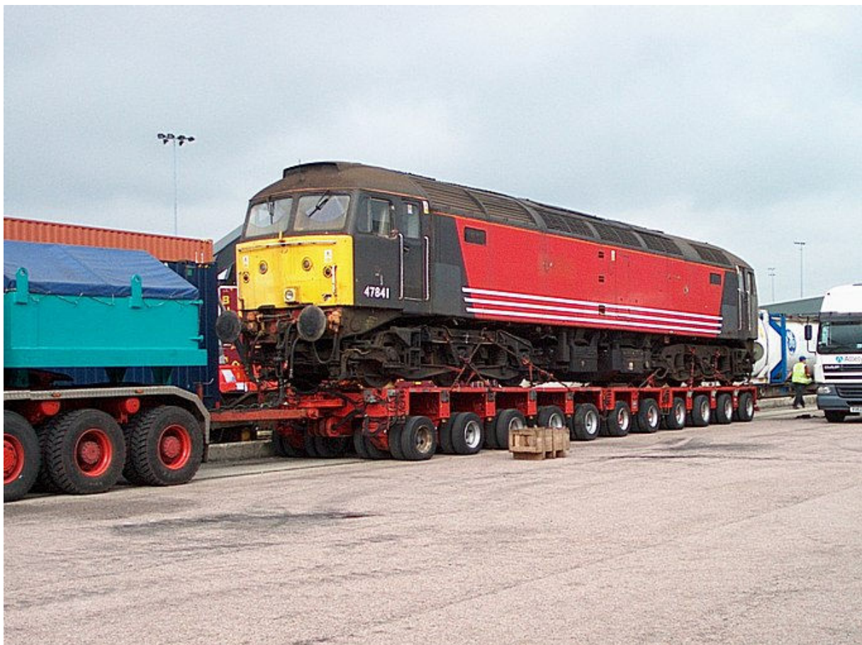
En route north from Dagenham 47841 at Tilbury 13/09/08 loaded for transfer to Barrow Hill