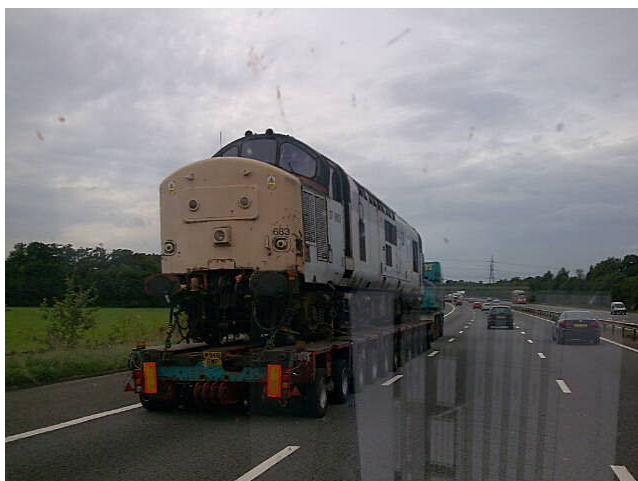
37683 on the M1 08/09/08 en route to Barrow Hill

For overhaul and transformation to a DRS machine 37683 has been transported north from Long Marston to Barrow Hill. It was noted en route on a low loader traversing the M40 mid afternoon.