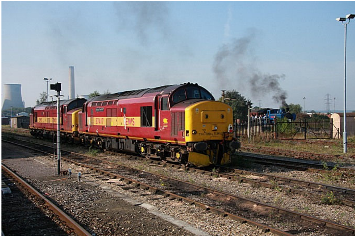
37417 and 37401 at Didcot 27/09/08 before being pressed back into service