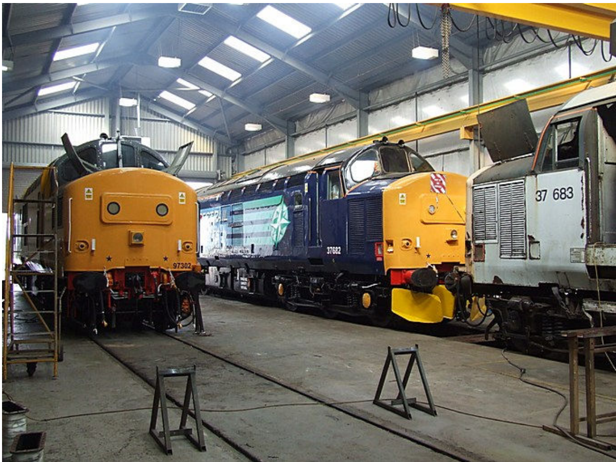
37682 37683 and 97302 undergoing attention at Barrow Hill 25/09/08