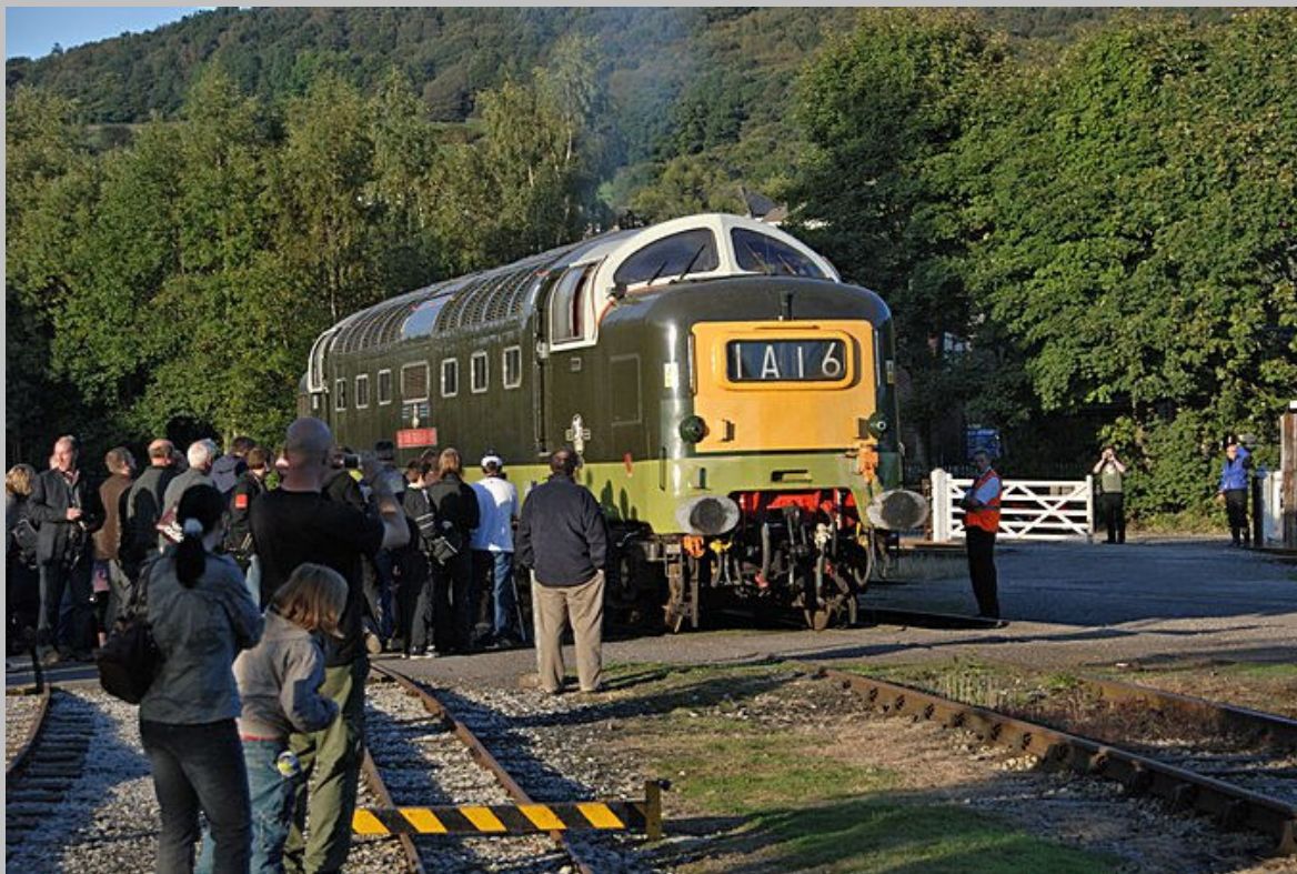
55016 retires service at Peak Rail 28/09/08