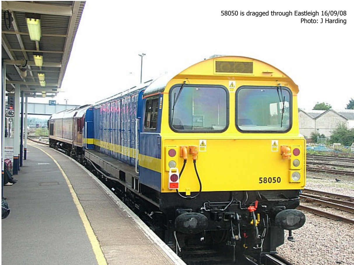
58050 is dragged through Eastleigh 16/09/08

57002 (XHHP) was taken north from Carlisle Kingmoor to Glasgow Works yesterday.