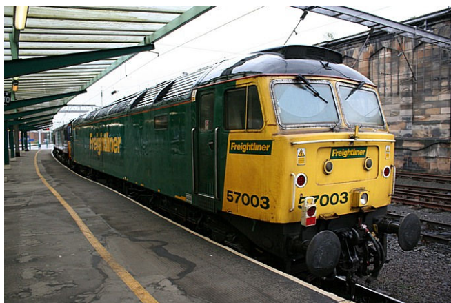
57003 at Carlisle 05/09/08 en route to Crewe