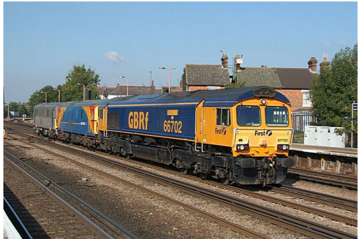
66702 73201 and 73107 at Tonbridge 26/09/08

Eastleigh bound 37401 and 37417 (both WKBN) had been stabled together at Didcot to await transfer to Eastleigh and store but the need for RETB equipped traction for a Cambrian ballast job has resulted in 37401 and 37417 being despatched north from Didcot to Bescot this afternoon for a return to traffic.