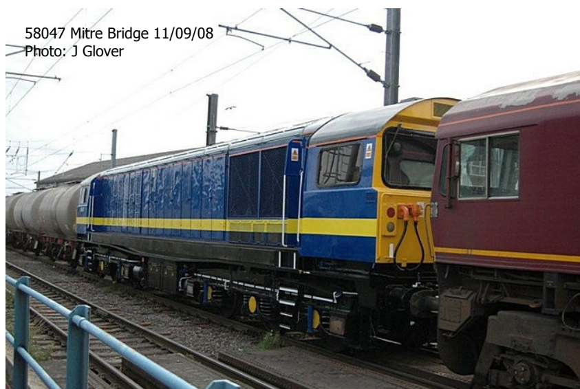
58047 Mitre Bridge 11/09/08

Cross Country power car 43321 (EHPC), the former 43121, has been released from re-engineering at Brush Traction and made its own way north today, with a barrier coach, from Loughborough to Craighentinn via the WCML.