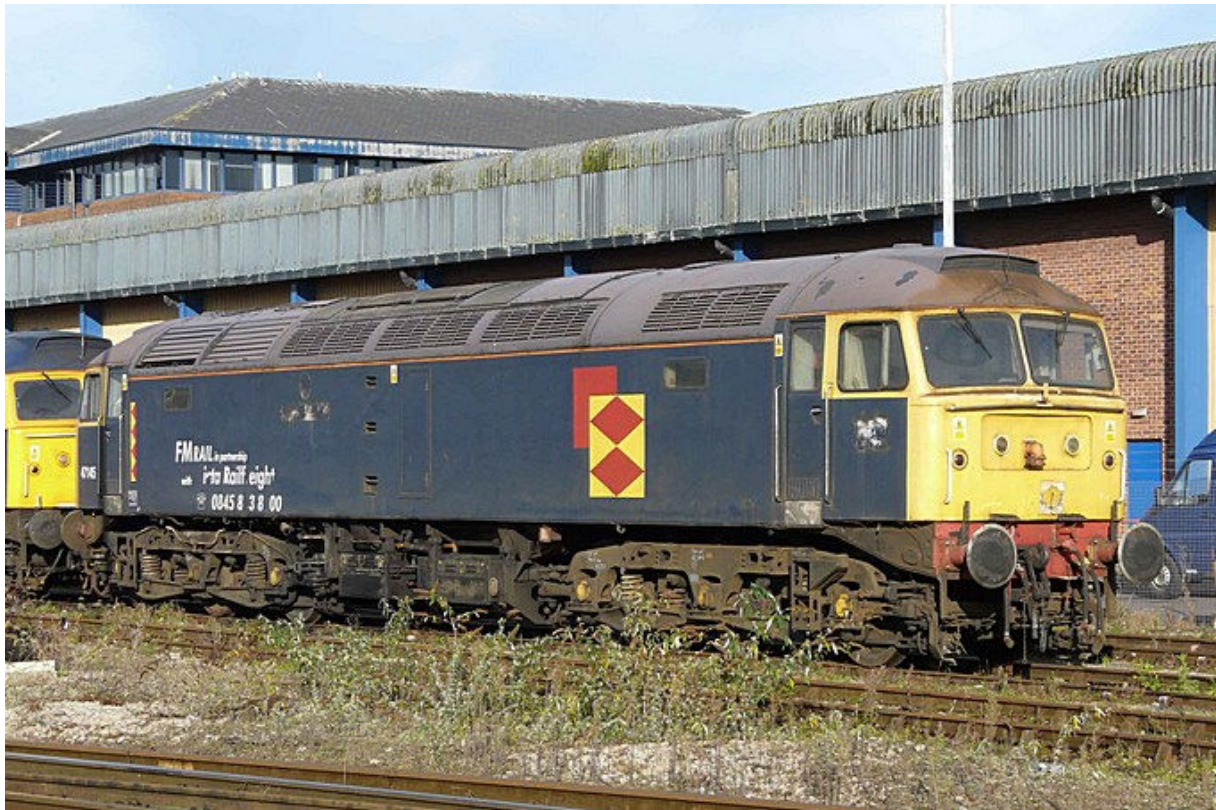
47145 at Gloucester 19/11/08