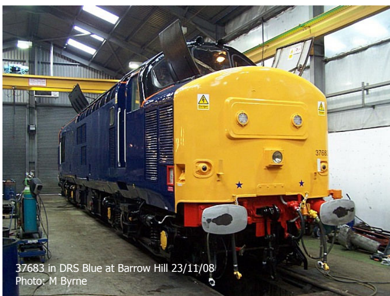
37683 in DRS Blue at Barrow Hill 23/11/08