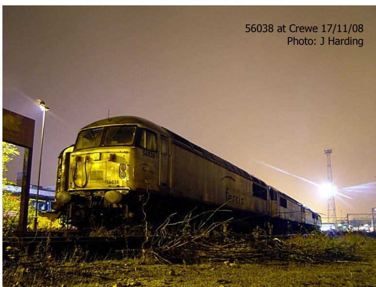
56038 at Crewe 17/11/08