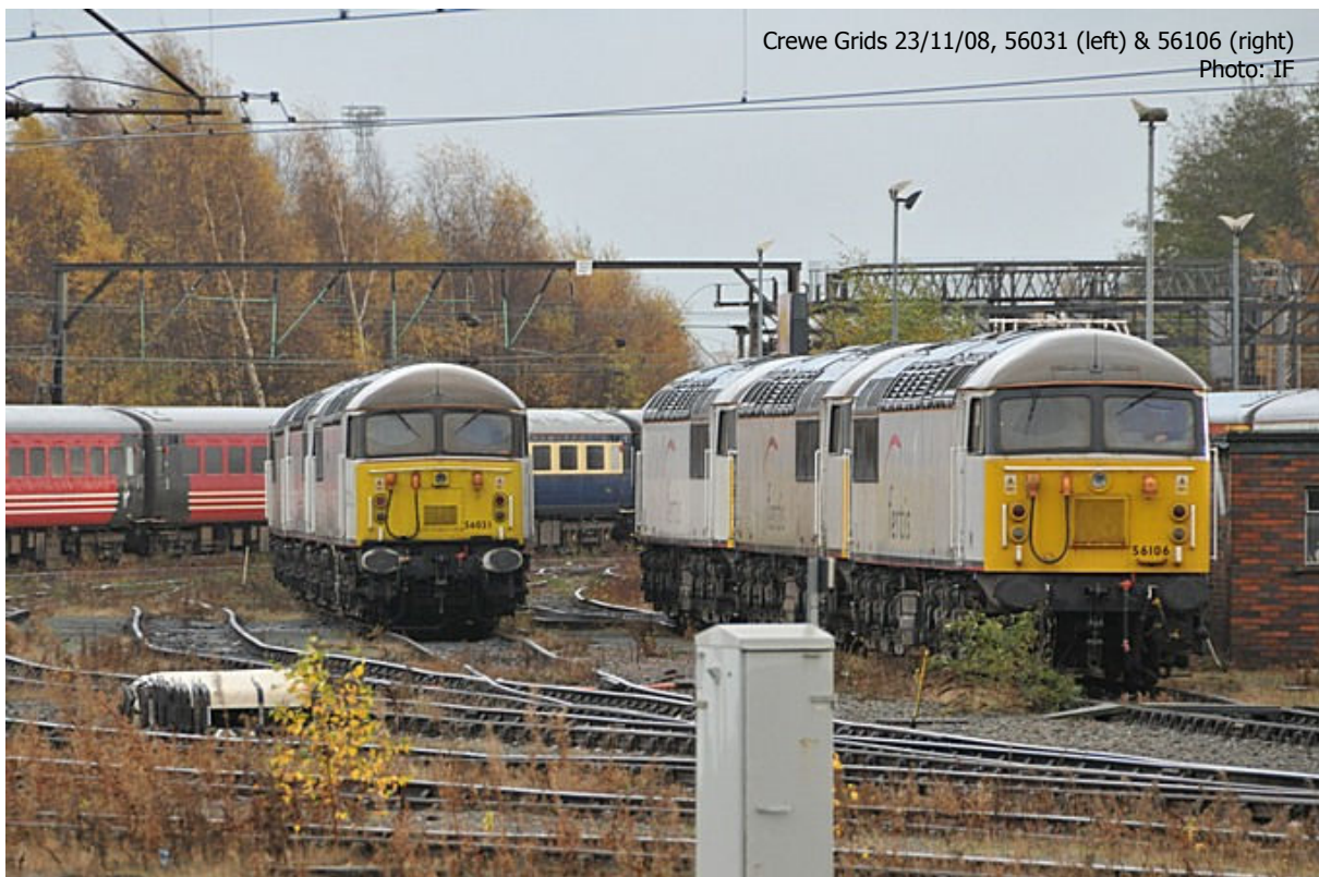
Crewe Grids 23/11/08, 56031 (left) & 56106 (right)

It has been advised that EWS are to run down and close Margam Depot in 2009.