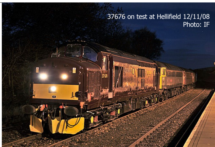
37676 on test at Hellfield 12/11/08