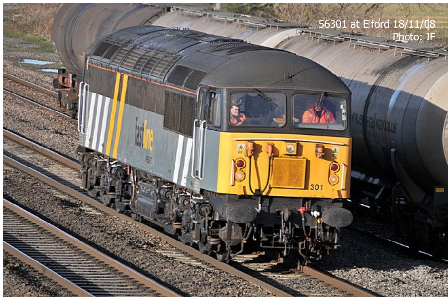
56301 at Elford 18/11/08

57315 (ATTB) is in the process of being re-liveried for use with Arriva at Cardiff Canton. It has been advised that two are to be re-liveried into Arriva colours and that two more are going to be painted into a neutral colour scheme. Notwithstanding this extra work for the fleet a reduction is in the pipeline for next year and Colas 47s are understood to be coming north to work some of the log train diagrams currently covered by VT 57/3s.