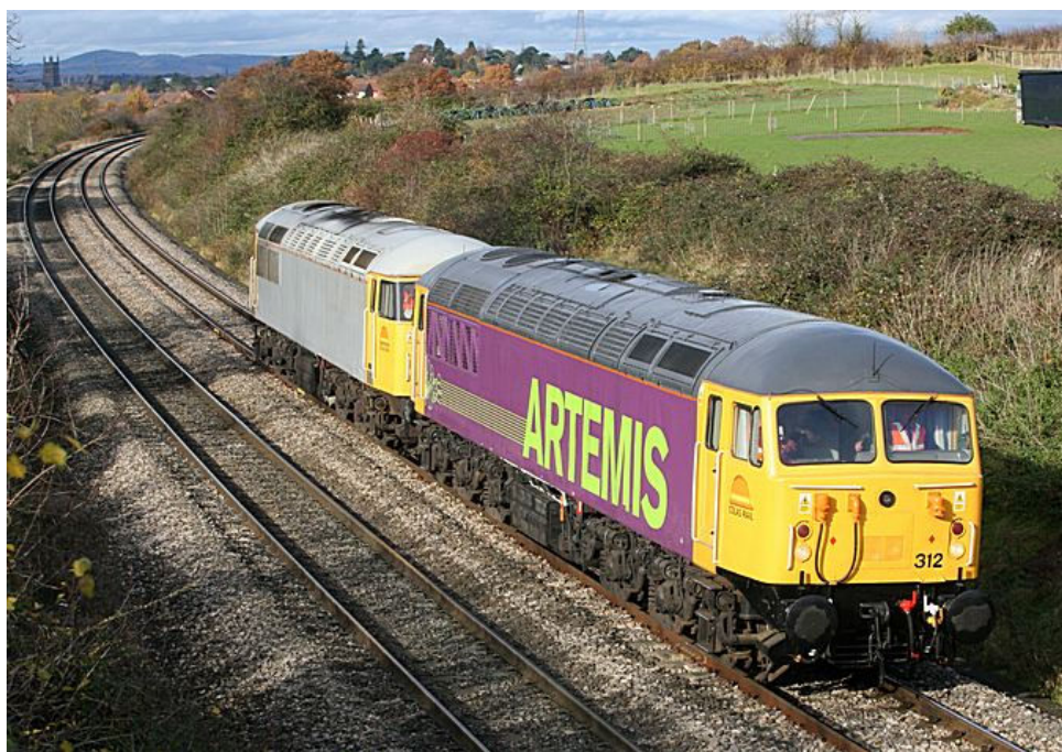
56312 & 56311 at Norton 14/11/08

56311 and 56312 have entered traffic proper running from Peterborough to Worcester then on to Long Marston to collect a rake of wagons for the commencement of next weeks steel movements to / from Immingham.