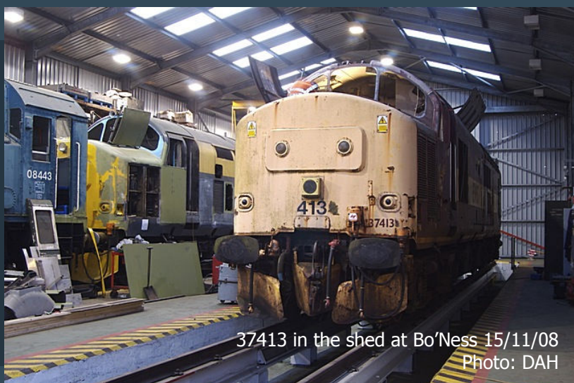
37413 in the shed at Bo'Ness 15/11/08