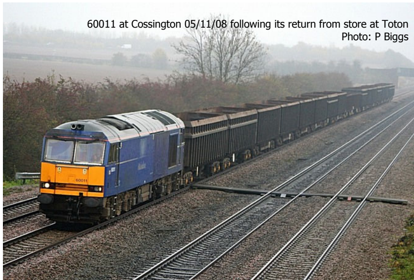
60011 at Cossington 05/11/08 following its return from store at Toton