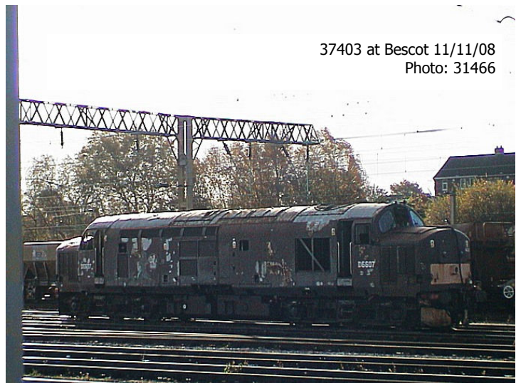
37403 at Bescot 11/11/08 Photo: 31466

66431 66432 66433 and 66434, the four new DRS Class 66s moved north last week, have been reallocated from MBDL to the XHHP holding pool whilst the four Freightliner examples on their way up to Crewe from Newport today have been reallocated from MBDL with 66954 66955 and 66956 going to the DFIN pool and 66957 being reallocated to the DFHG pool. 47528, scrapped back in May, has now been de-registered from CRUR whilst 47703 at Leeming Bar and 47714 at Loughborough have been de-registered from CREL. 87010 87022 and 87028, recently despatched abroad have been de-registered from SBXL although 87007 87008 and 87026 which left the UK in June are still on the system allocated to SBXL.