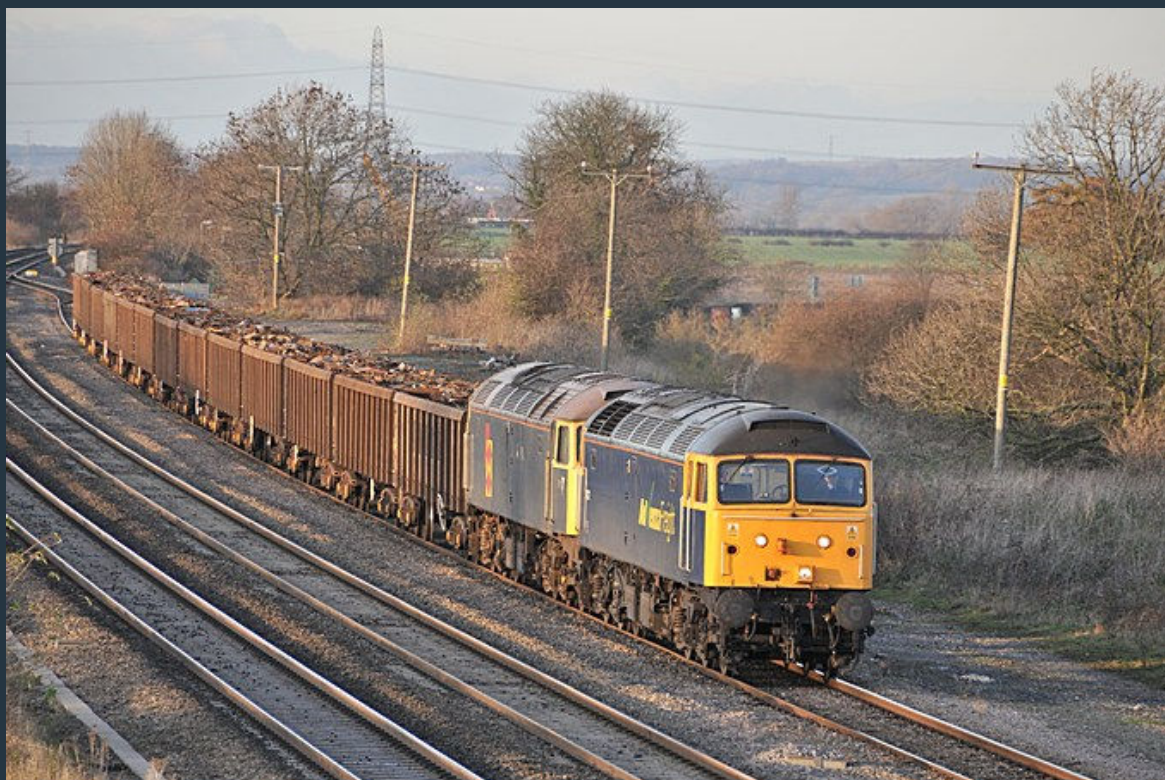
47237 with 47145 – en route to Gloucester – in tow at Elford 18/11/08