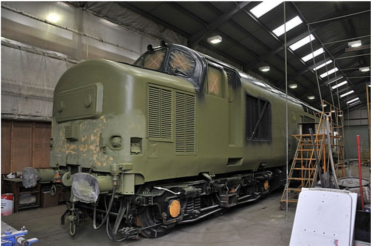
37683 in undercoat at Barrow Hill 10/11/08

Bo'Ness bound 37403 (WNSO) has been brought up from Margam to Bescot to await forwarding to Scotland. It is anticipated that, like 37413 recently, it will be conveyed north in the consist of tomorrow's 6S73 from Bescot to Mossend where it will be paired up with 37413 for the final leg to Bo'Ness.