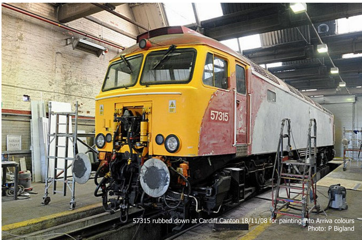
57315 rubbed down at Cardiff Canton 18/11/08 for painting into Arriva colours