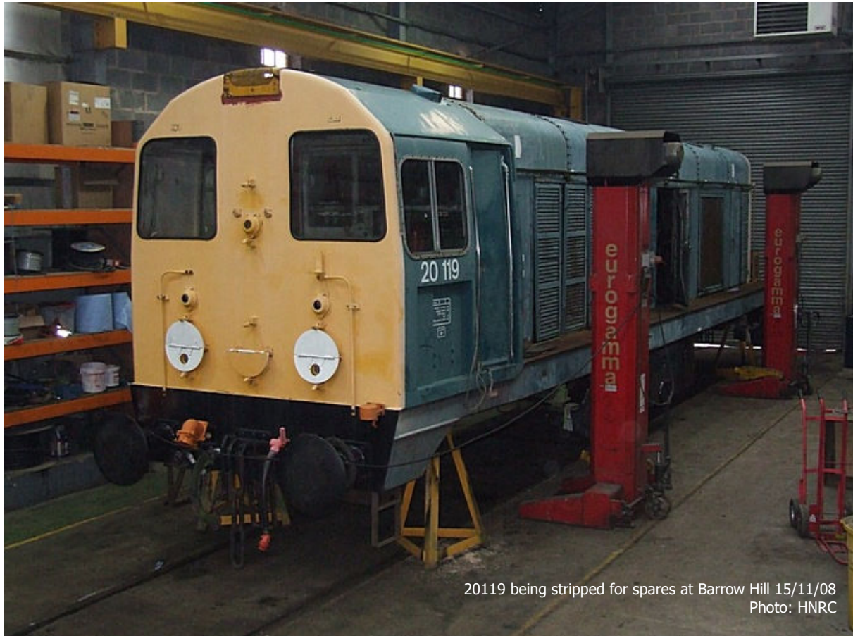
20119 being stripped for spares at Barrow Hill 15/11/08

Immingham Nordic 06:05, Barnetby 06:31, Wrawby 06:34, Lincoln 07:38, Newark Crossing 08:10, Nottingham 08:47, Trent 09:01, Stenson Jn 09:23, Burton on Trent 09:37, Wichnor 09:45, Tamworth HL 10:24, Water Orton 10:38, Washwood Heath 10:53