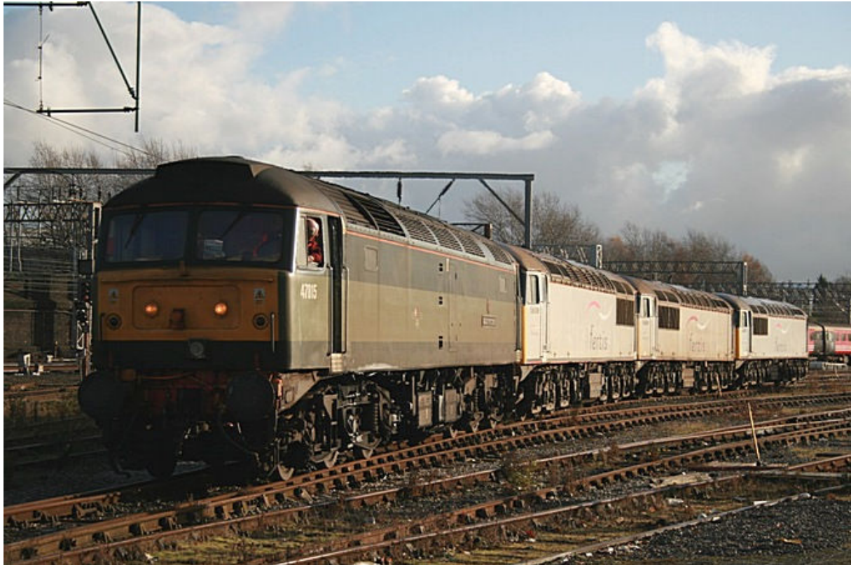
47815 being utilised for the shunt of the ex Fertis Class 56s at Crewe DMD 09/12/08