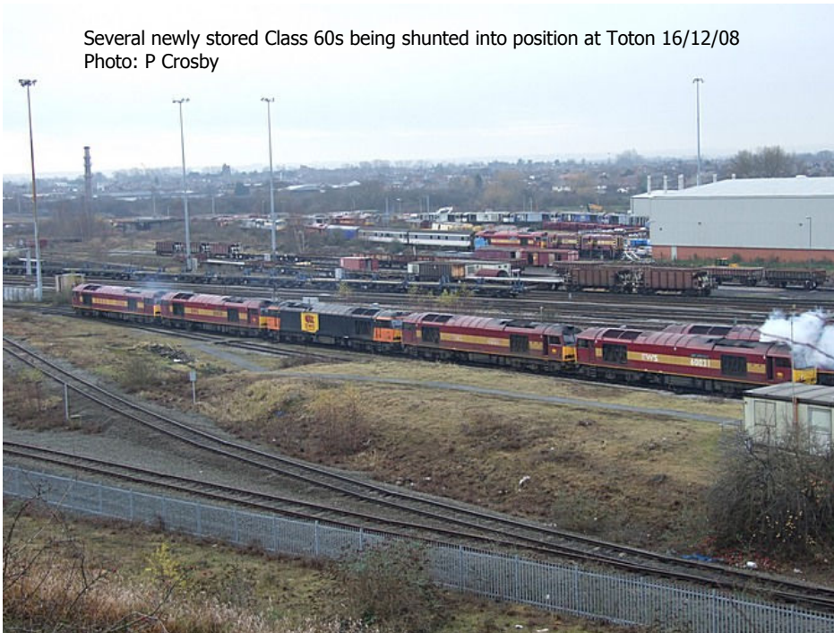
Several newly stored Class 60s being shunted into position at Toton 16/12/08

37417 moved south overnight from Carlisle to Eastleigh has been stored WNXX on arrival at Eastleigh whilst 37670 which, it has been established, is undergoing repair work at Knottingley has been reinstated to the WFMU pool pending a return to use.