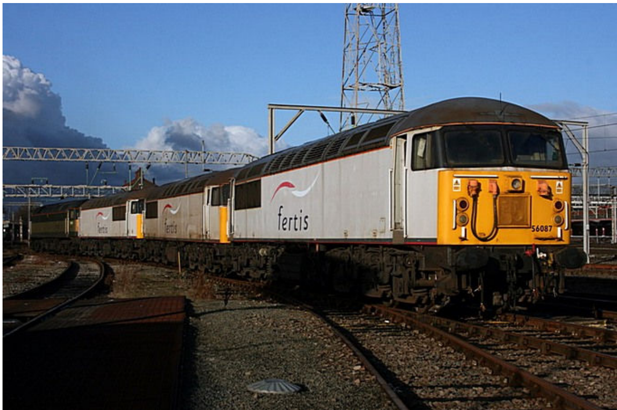
56087 heads the line of ex Fertis Class 56s being shunted into Crewe DMD 09/12/08