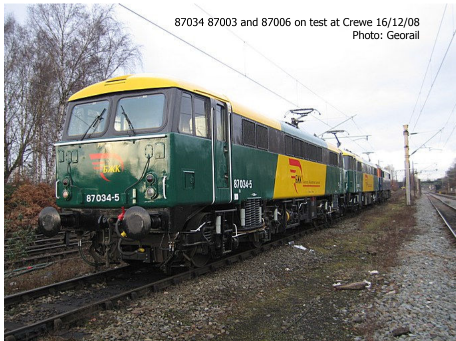
87034 87003 and 87006 on test at Crewe 16/12/08

The two Colas / Hanson Traction Grids returned to Wansford, Nene Valley Railway today as planned.