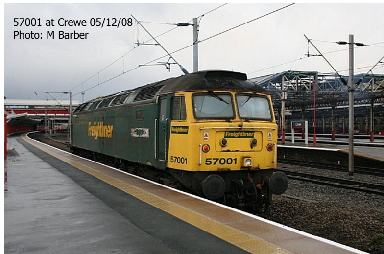
57001 at Crewe 05/12/08

92044 (WNWX) has been released from Brush Traction being noted heading south from Loughborough on a low loader overnight and on the M25 this morning en route to Dollands Moor.