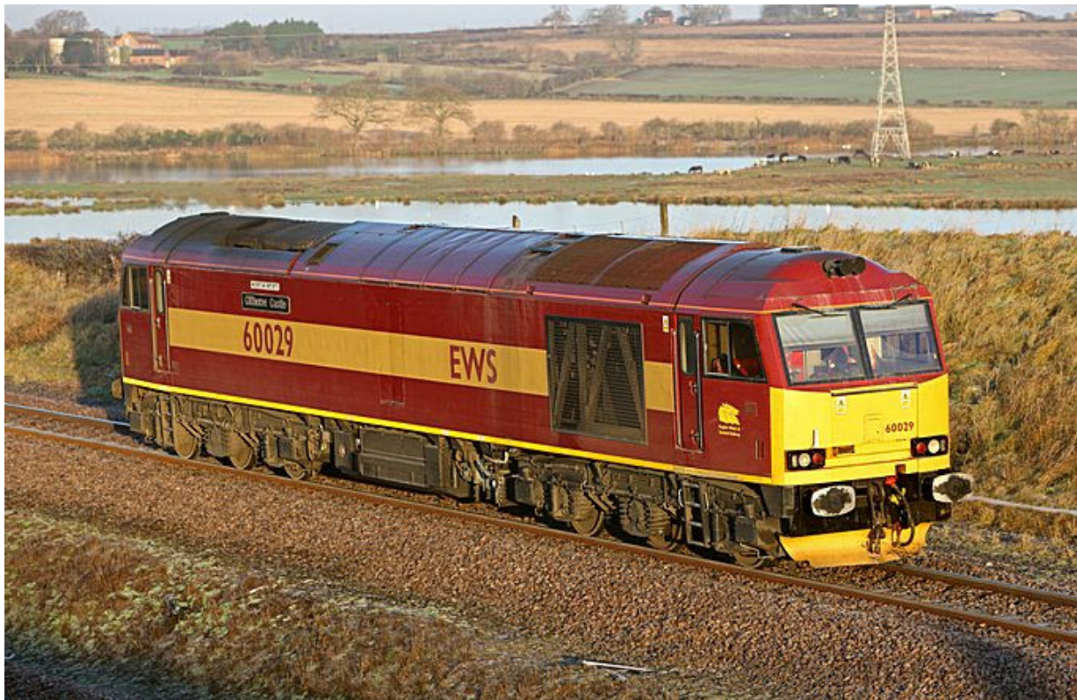
60029 at Wellingborough 09/12/08, en route to Toton and store...

Two less, 09017 at Alexandra Dock Junction and 60029 at Toton have been stored WNTS.