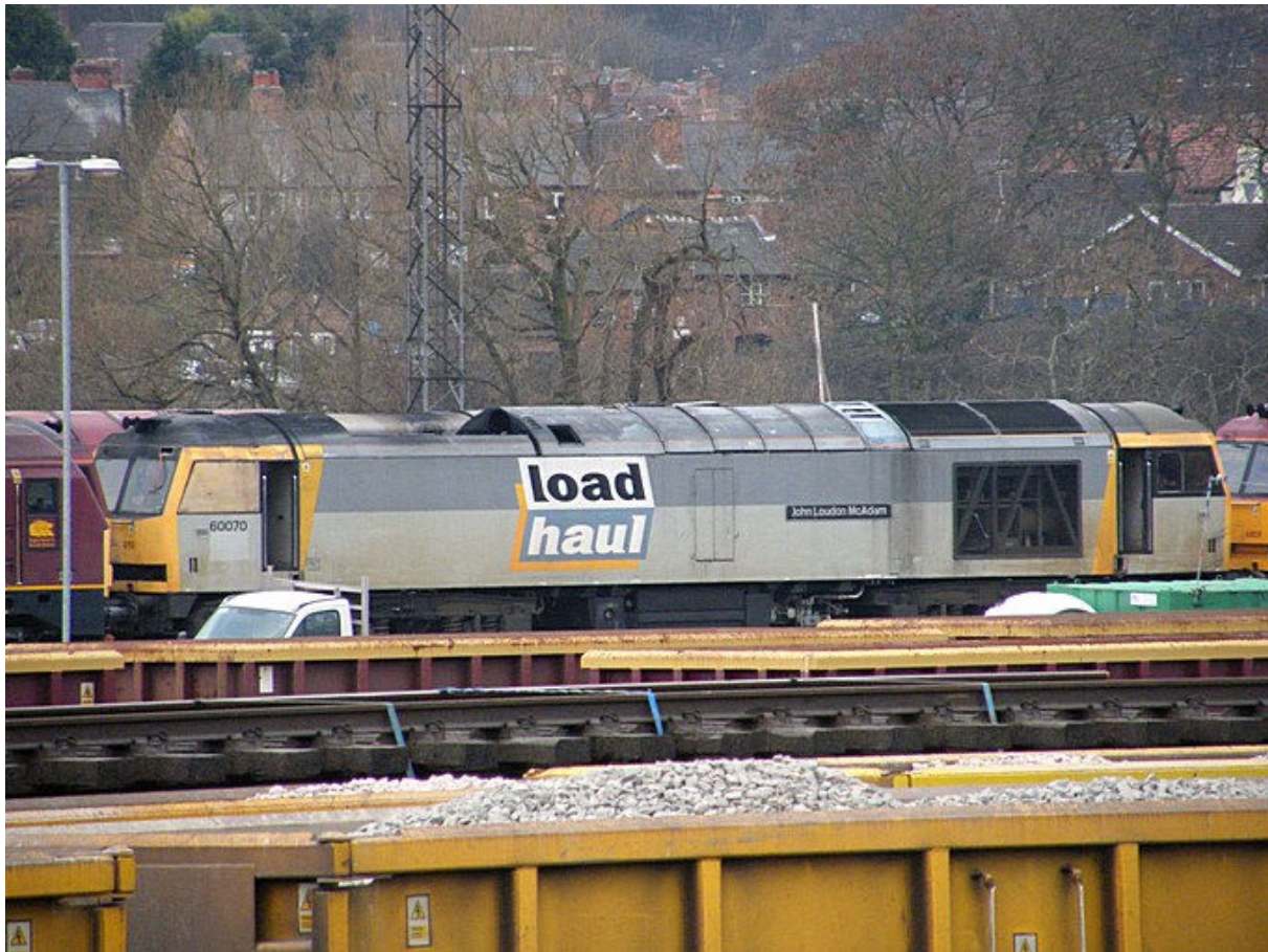
A rather forlorn 60070 at Toton 27/12/08

Since being stopped for store at Margam 60041 (WNTR) have been moved up to Toton.