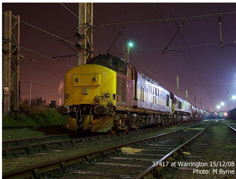
37417 at Warrington 15/12/08

60061 (WCAN) is ready for its mainline return being booked to work from Toton to Crewe and back whilst 60062 (WCAN) has turned up at Aberdeen for snow duties alongside 37401 (WKBN) which has reached Inverness.