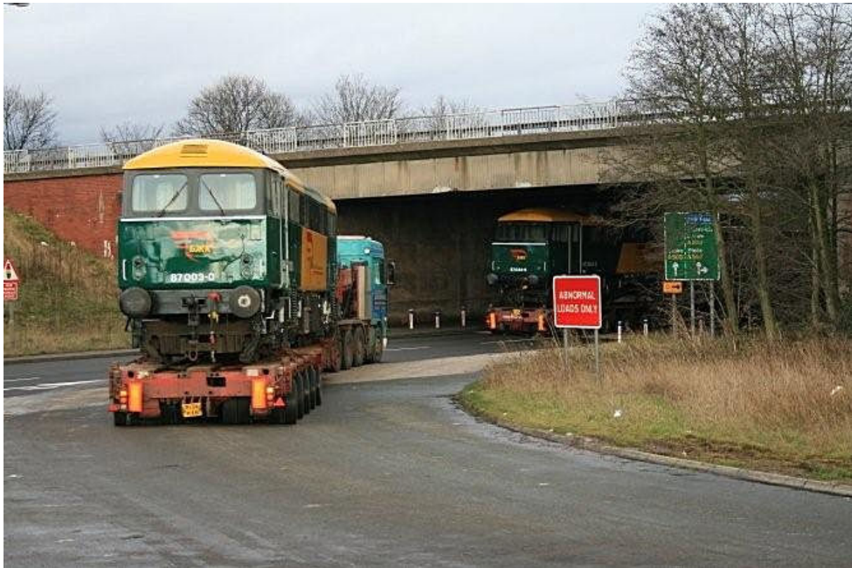
87003 and 87034 on their way at Crewe 21/12/08

On low loaders 87003 87006 and 87034 (all SBXL) have been transported across from Crewe to Hull today for export to Bulgaria. Providing all goes to plan, there had been a delay in the Crewe area, the lorries with the Class 87s will be on the overnight sailing from Hull to Rotterdam where the 87s will be transferred to barges for shipment up the Rhine and on to Bulgaria. The next three Class 87s being prepared at Long Marston for export, all three of which will be out-shopped in BRC green and yellow, are 87011 87020 and 87029.