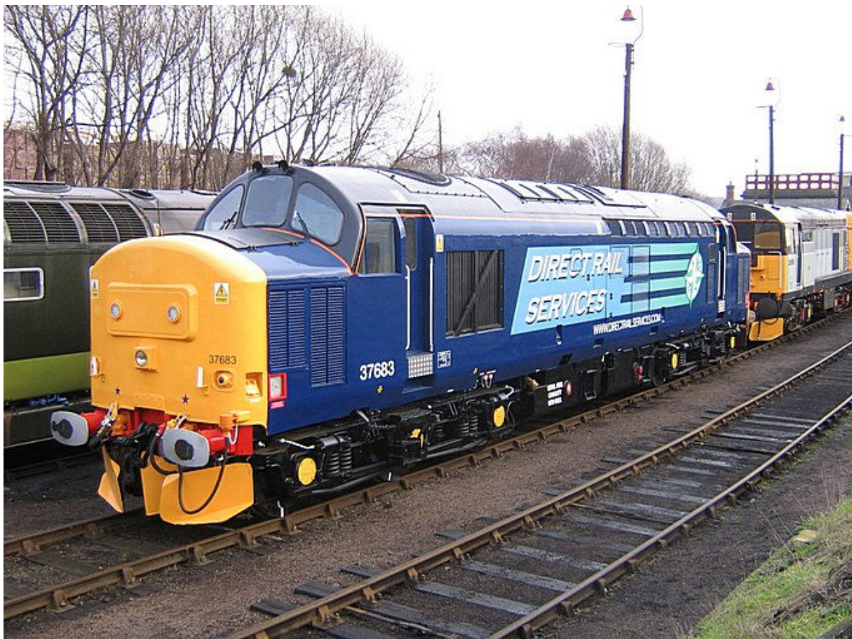
37683 in full DRS 'Compass' livery at Barrow Hill 21/12/08

Although discovering who has bought what from EWS in the latest round of sales is going to require a little more investigation yet the new owners of 37421 have advised that it is being purchased by L&S Locomotives, the current owners of 37023 37116 and 37219, and that a decision with regards to 37421's prospective new home, it currently resides at Motherwell, is to be made in the near future.