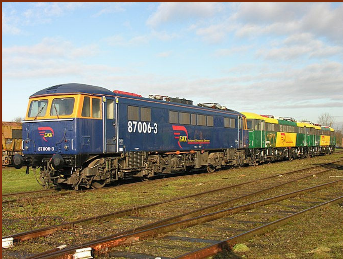
87006 87003 & 87034 await collection from Long Marston 10/12/08